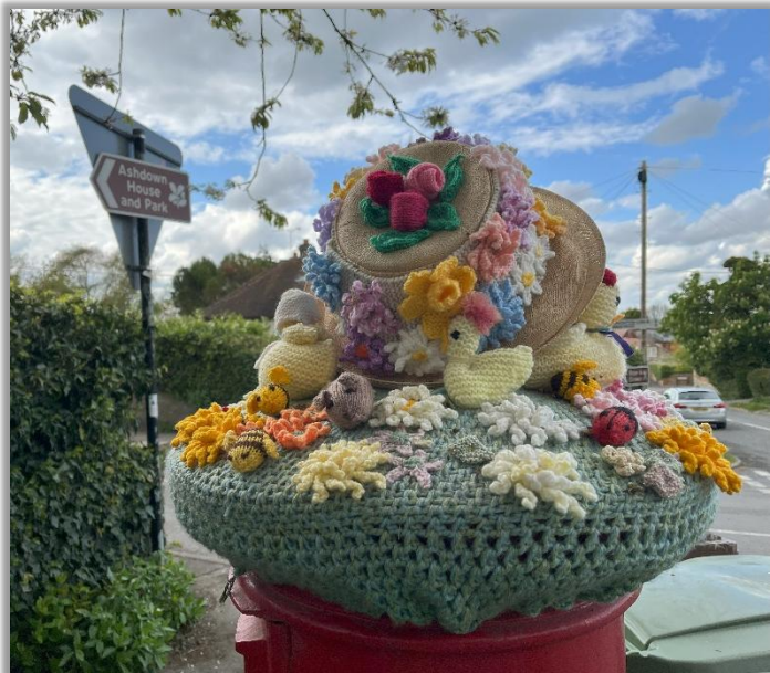
Easter Bonnet Postbox topper at Ashbury crossroads

In aid of St Mary's Church and Longcot Village Trust.