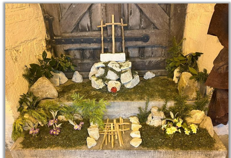
Easter Garden in St Mary's Church Ashbury